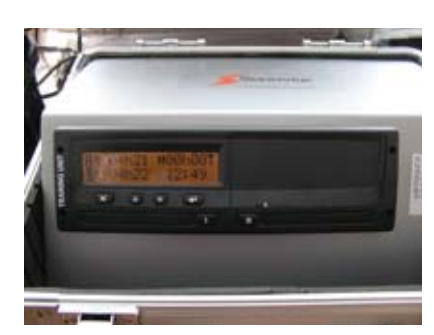
Fig. 1. View of certificated vehicles unit – digital tachograph