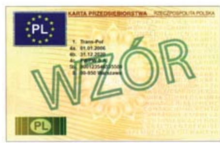
Fig. 2. View of cards in digital tachographs system in Poland